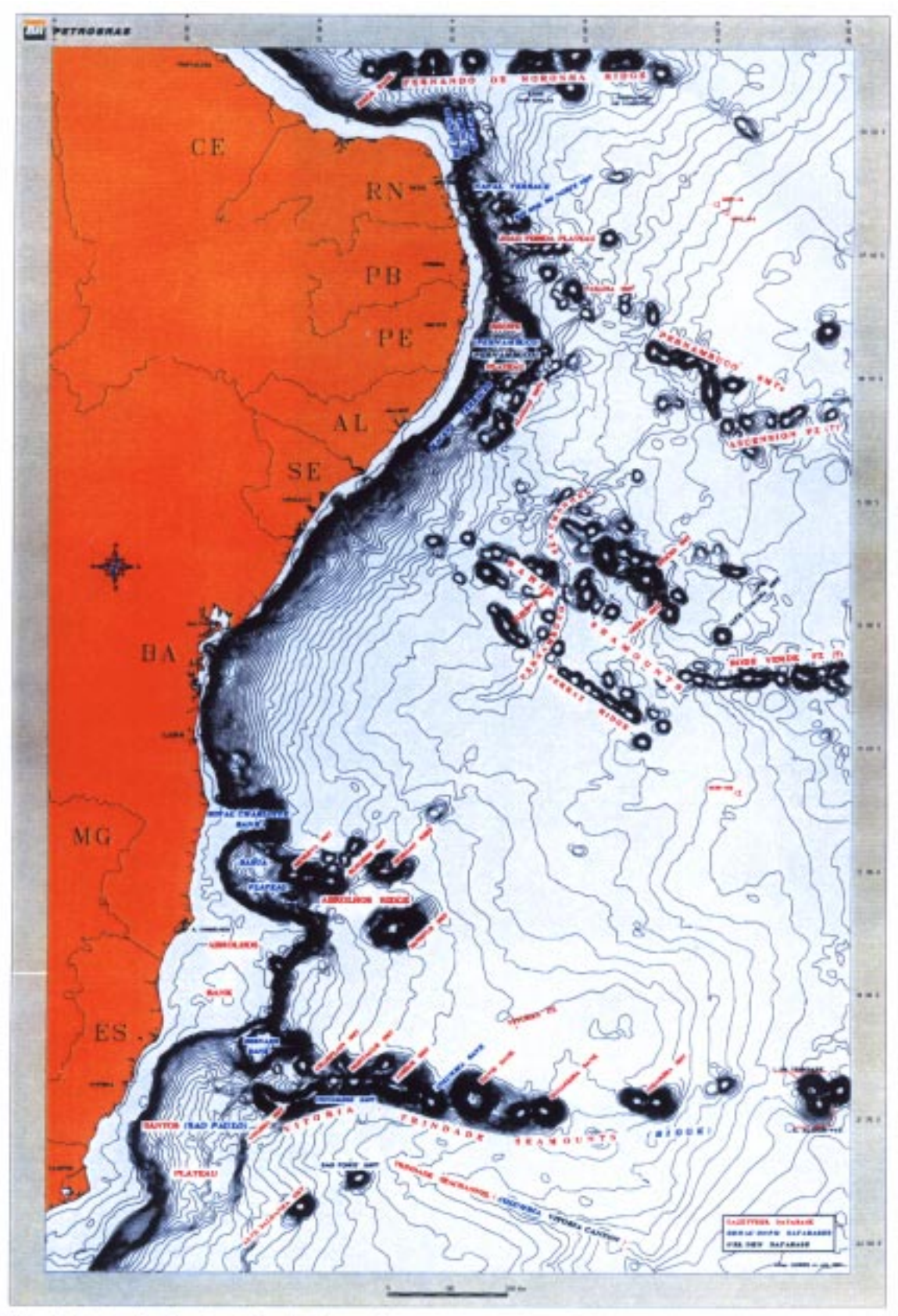
Pigure 2. Eastern Brazil continental margin undersea features