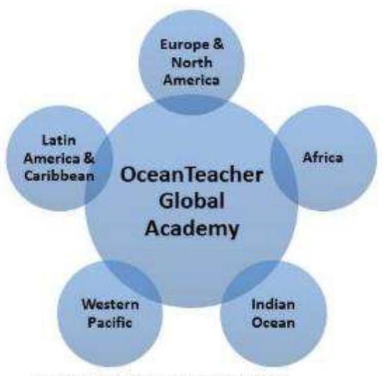
Figure 1: Schematic diagram of the OceanTeacher Global Academy elements: Regional Training Centres (RTCs) will be established in the different geographical areas.