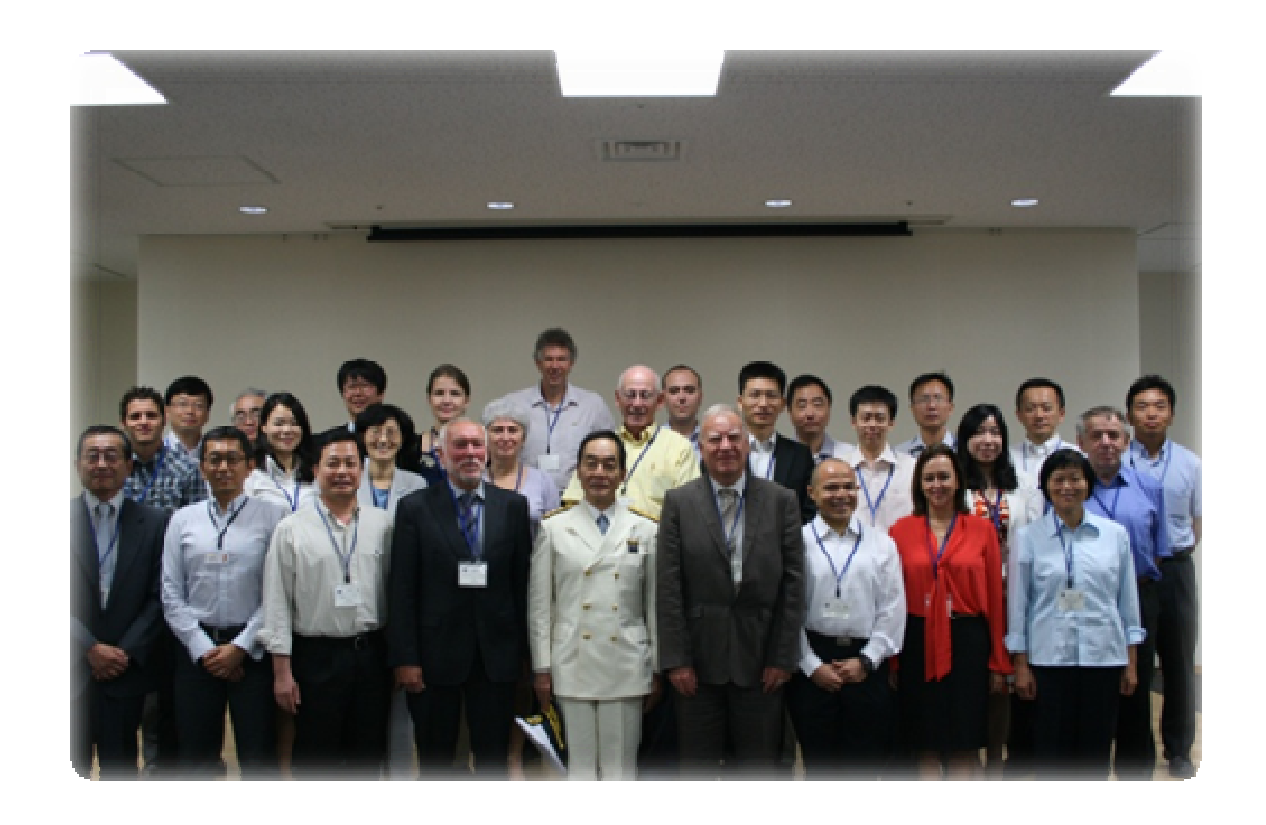
Attendees at SCUFN 26, Tokyo, Japan