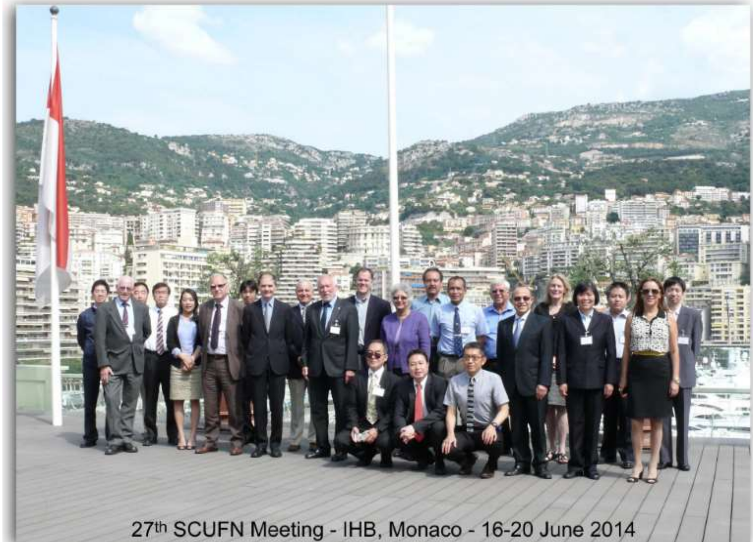
27 th SCUFN Meeting - IHB, Monaco - 16-20 June 2014