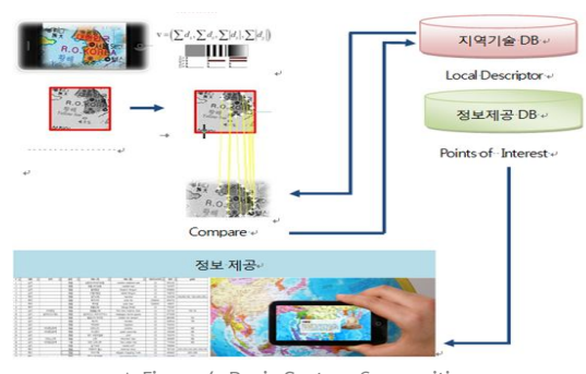
▲ Figure 4. Basic System Composition