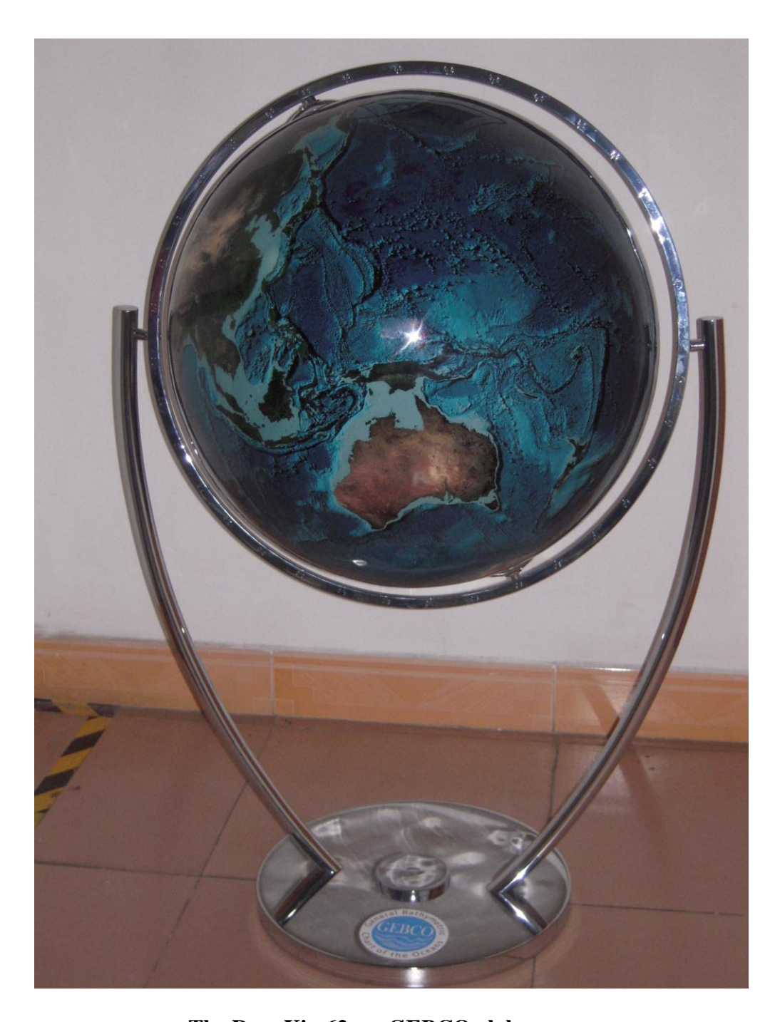
The DongXin 62 cm GEBCO globe