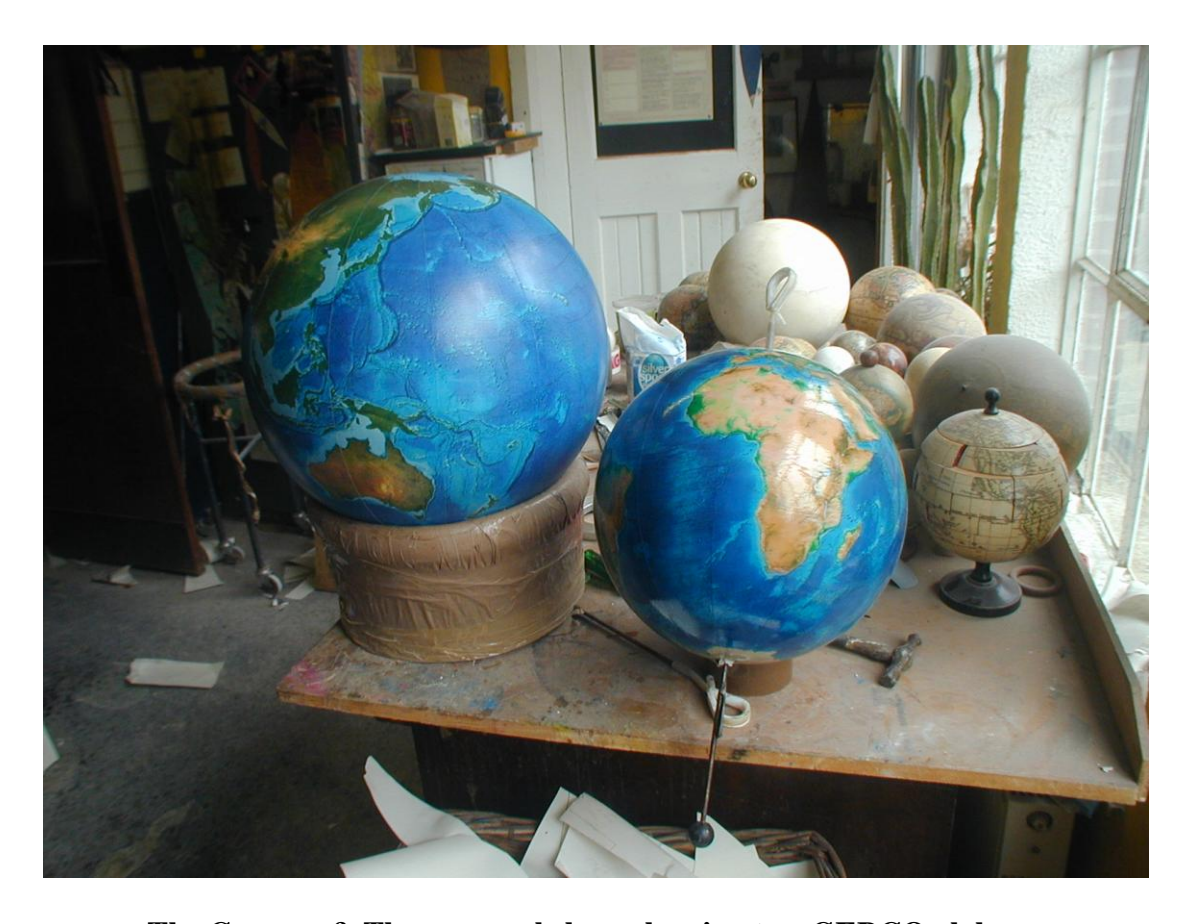
The Greaves & Thomas workshop, showing two GEBCO globes