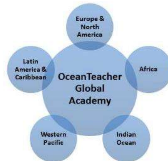
Figure 1: Schematic diagram of the OceanTeacher Global Academy elements: Regional Training Centres (RTCs) will be established in the different geographical areas.