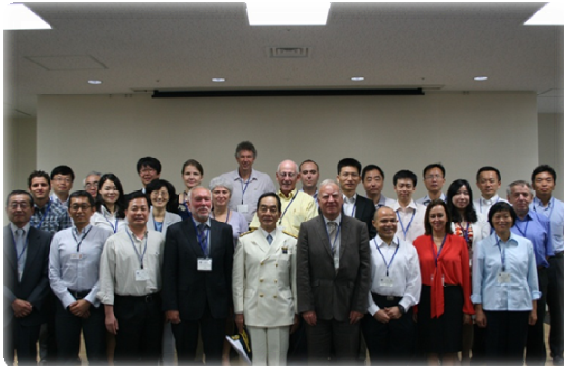
Attendees at SCUFN 26, Tokyo, Japan