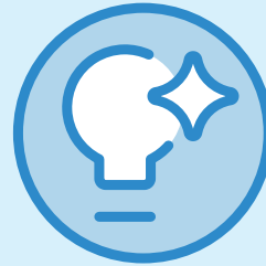
PILLAR TWO: TECHNOLOGIES & STANDARDS

Delivering open and fit for purpose seabed data .