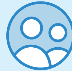
PILLAR FOUR: COMMUNITY

Supporting, promoting and using innovative solutions to continuously improve the GEBCO data value chain.