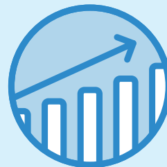
PILLAR THREE: CAPACITY

Engaging communities and partners to best deliver GEBCO's mission.