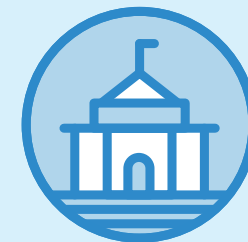
PILLAR FIVE: GOVERNANCE

Establishing global infrastructure to develop capacity .