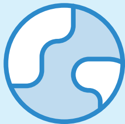
PILLAR ONE: DATA

Delivering open and fit for purpose seabed data .